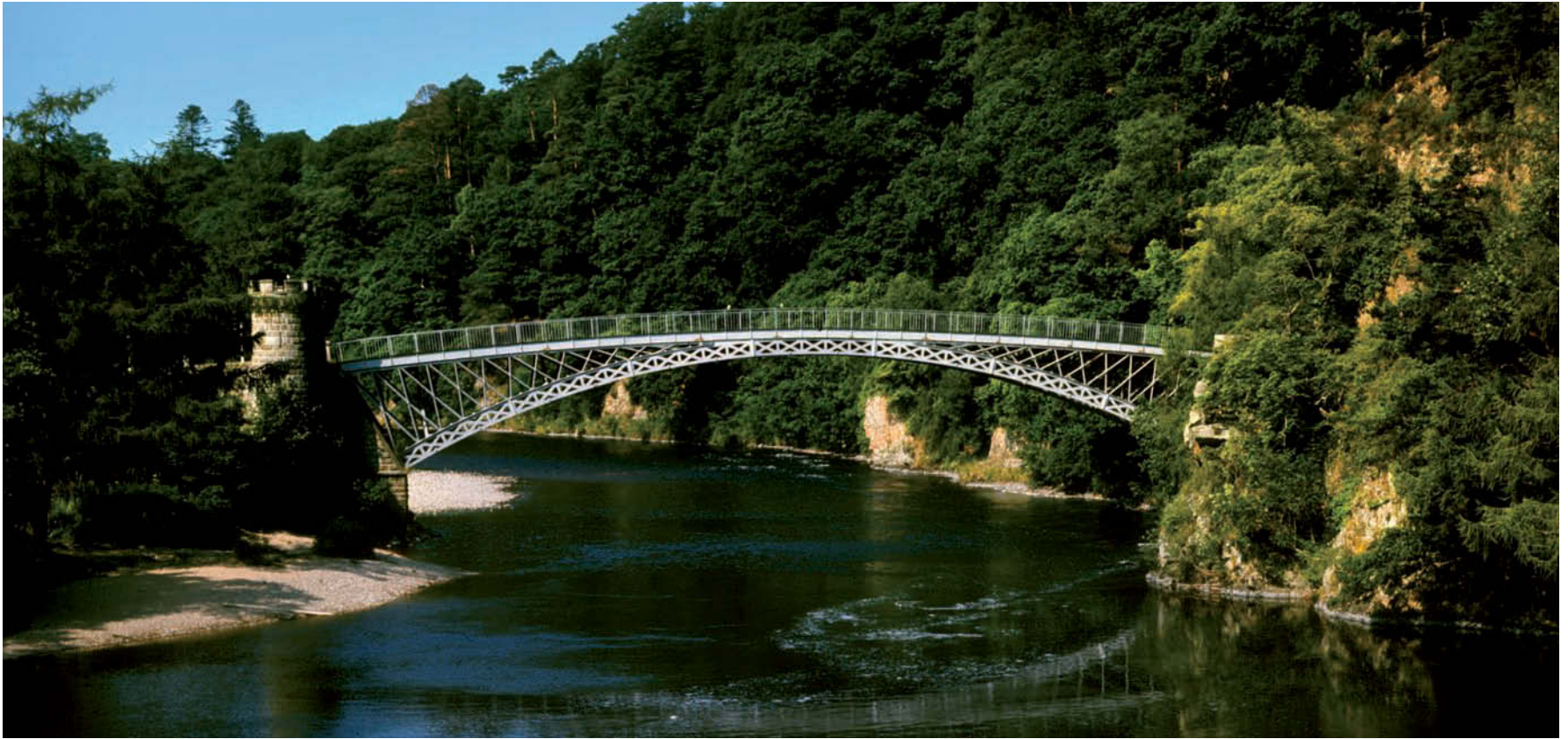
[above] Telford's elegant bridge over the River Spey at Craigellachie.